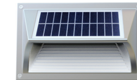
WALL MOUNT LIGHT | RP-SML COMPARES TO 35W HALOGEN