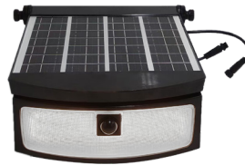
--- DETACHABLE SOLAR PANEL W/ 10 FT CABLE